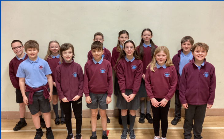
On the last day of the ski trip, all the pupils took part in a slalom race. This picture includes several of the medalists!