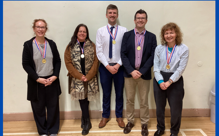
Pictured is the winning quiz team from the ski trip. It was a proud moment for the staff to finish in 1 st place ahead of all the parents' teams!!!