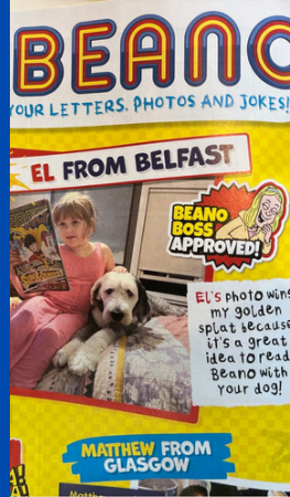
El appeared in a recent edition of the Beano comic.